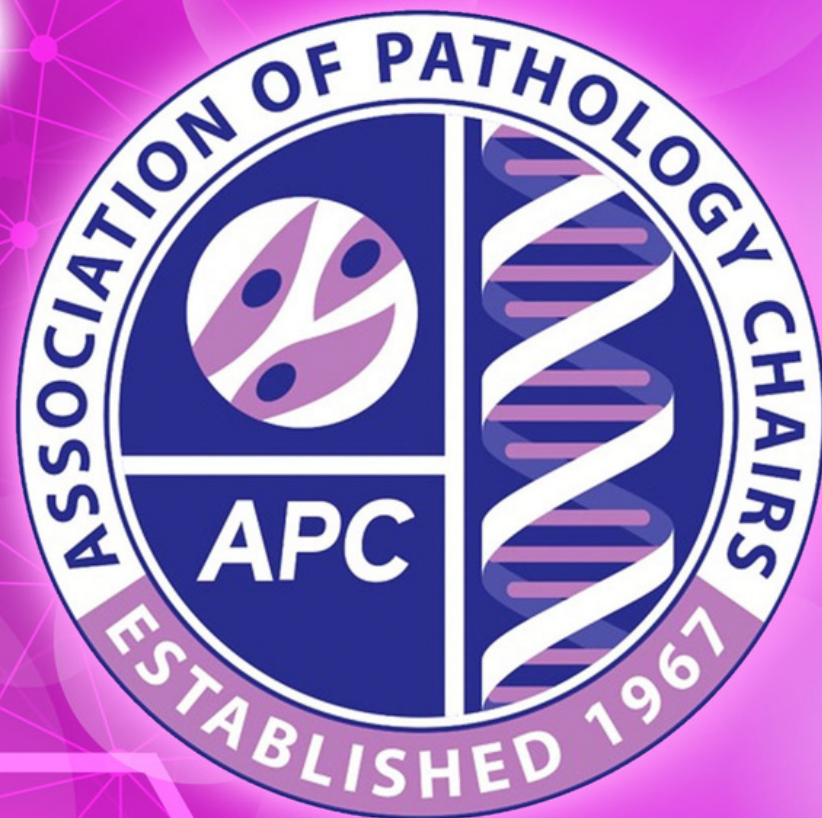
EXHIBIT AND SPONSORSHIP PROSPECTUS